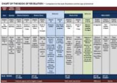
CHART: THE BOOK OF REVELATION

THE CHART OF THE Book of Revelation is companion to the book, " Revelation and the Age of the Antichrist. " It charts the book of Revelation following its natural order as given to the apostle John by Jesus Christ. Following this outline, we understand when the apostasy of the church takes place, the Antichrist will appear, the great tribulation will be released, Jesus will return, and the rapture occurs.