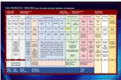
CHART: THE PROPHETIC TIMELINE

THE PROPHETIC TIMELINE is your guide to ordering the main events of the last days. The Prophetic Timeline charts the last day nations and events recorded in the books of Daniel, Matthew 24, and Revelation to give a comprehensive timeline from around the early 600's to the establishment of God's kingdom.